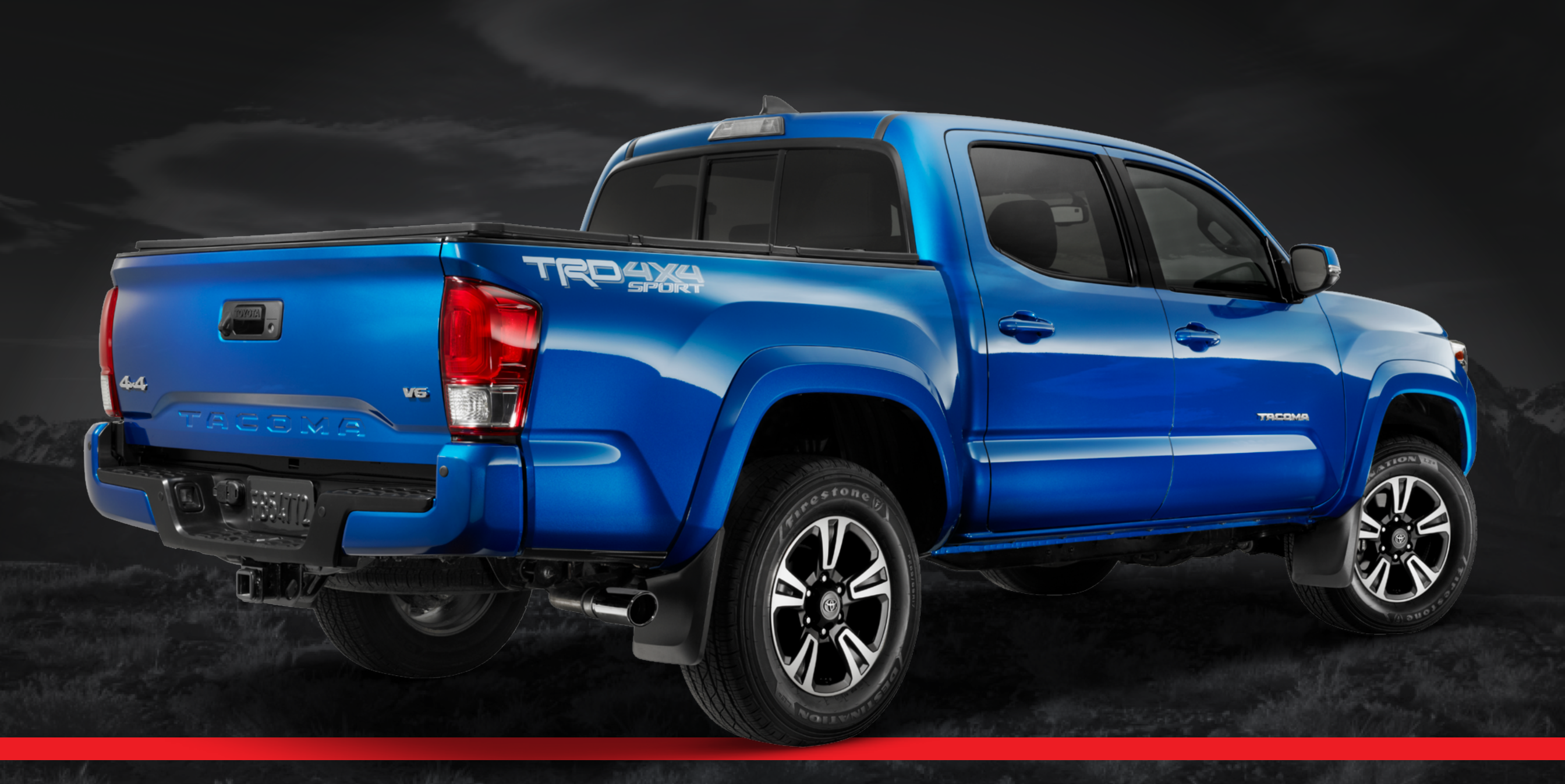
EXTERIOR 3 INTERIOR 20 TRD 29 TRD PRO 36